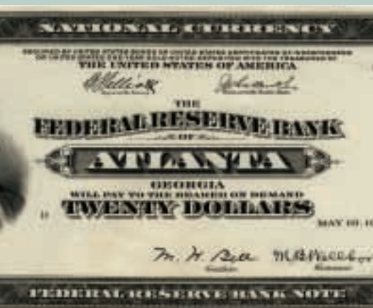
$20 Federal Reserve Bank Note, 1918, face

The main difference between the Federal Reserve Notes and Federal Reserve Bank Notes was that the former were obligations of the U.S. Government whereas the latter were obligations of the individual Federal Reserve banks that issued them. Not all Federal Reserve banks issued the notes at the same time, nor did individual Federal Reserve banks issue the same denominations. Federal Reserve Bank Notes never constituted a significant portion of the overall currency of the country.