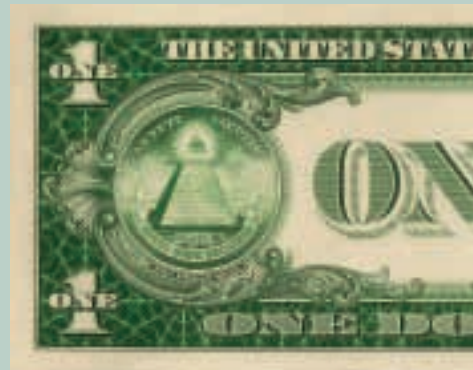
$1 Silver Certificate, 1935, showing details of both sides of the Great Seal

The procedure for changing the series date has changed a number of times since the introduction of paper money. Currently, a new series will result from a change in the Secretary of the Treasury, the Treasurer of the United States and/or a change to the note’s appearance, such as a