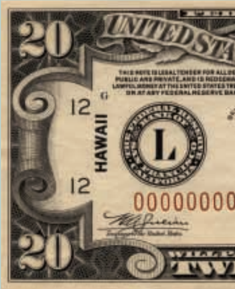
$20 Federal Reserve Note with “Hawaii” overprint

This provision means that United States currency serves as a valid and legal form of payment for goods, services, or other obligations. However, there are no Federal laws requiring private businesses to accept cash as a form of payment and such establishments are free to develop their own payment policies unless state laws indicate otherwise.